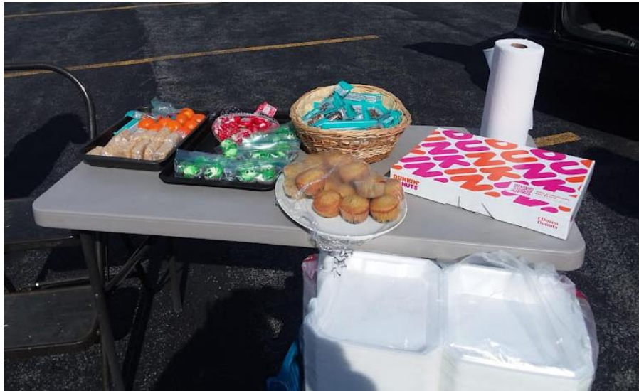
The tailgate goodies.

Below is Netty Palladino's panoramic photo of the event.