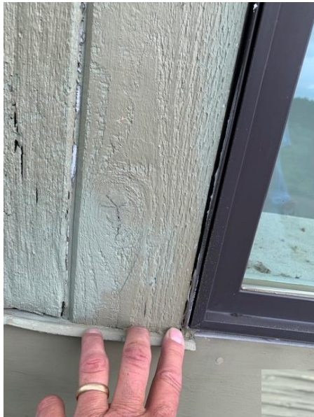
Sanctuary Atrium Windows